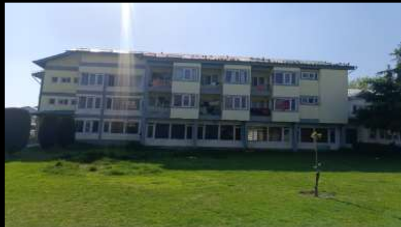
GANI KASHMIRI RESIDENTIAL COACHING HOSTEL