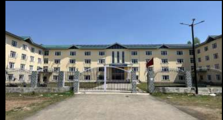
GANI KASHMIRI INTERNATIONAL RESEARCH SCHOLAR HOSTEL,