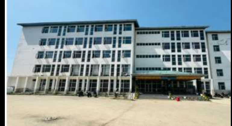
SHEIKH-UL- AALAM (SA) BOYS HOSTELS (BLOCK-B)