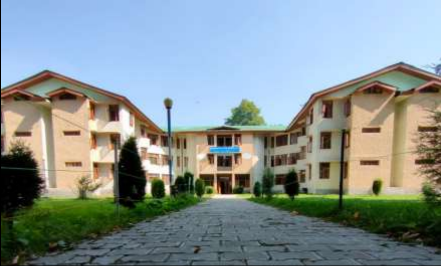
M .A. HOSTEL