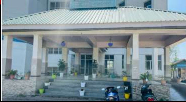
SHEIKH-UL- AALAM (SA) BOYS HOSTELS (BLOCK-A),