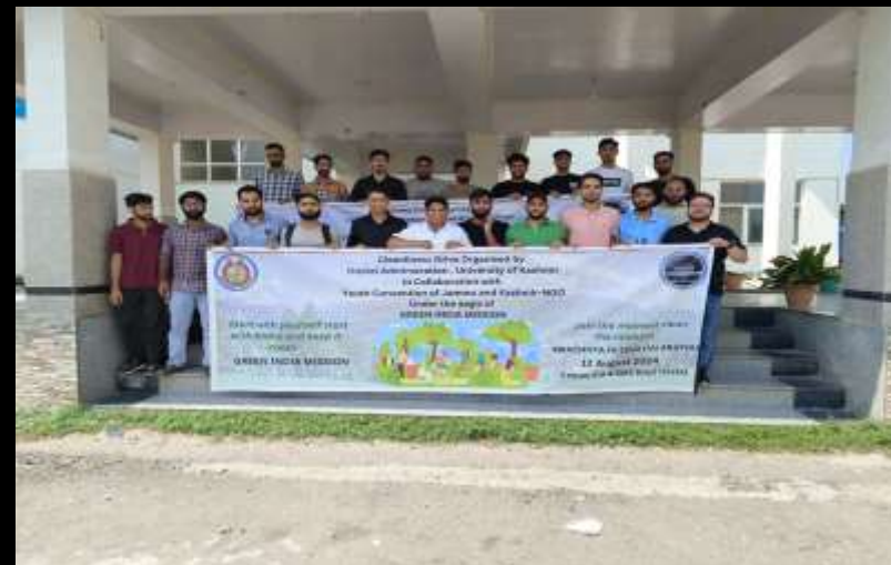
Cleaning Drive ( M.A. Hostel)