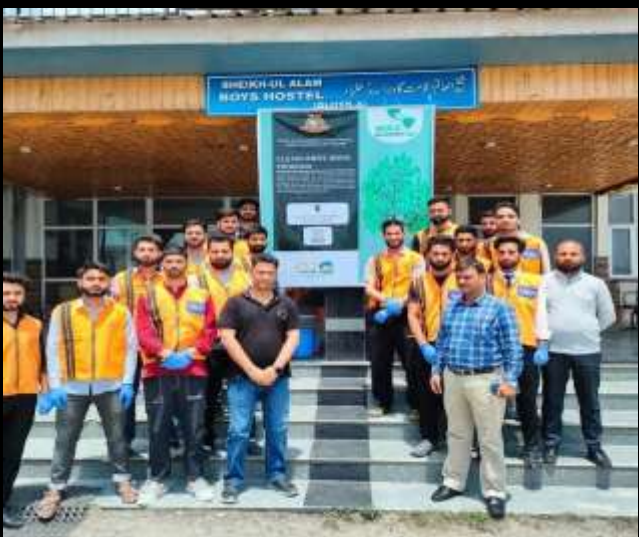
Swachh Bharat Event