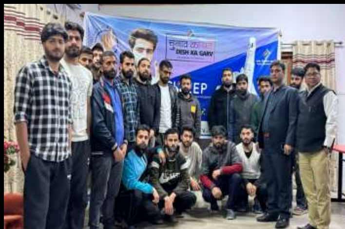
SVEEP AWARENESS PROGRAMME (VOTING RIGHTS EDUCATION)