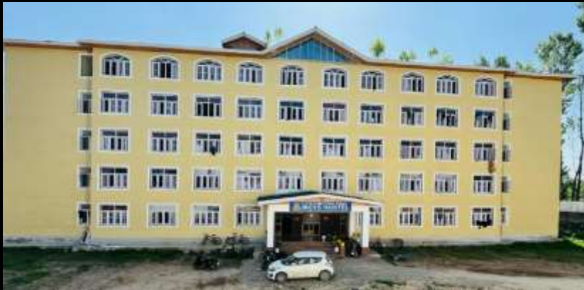
SYED MEERAK SHAH UNDERGRADUATE BOYS HOSTEL